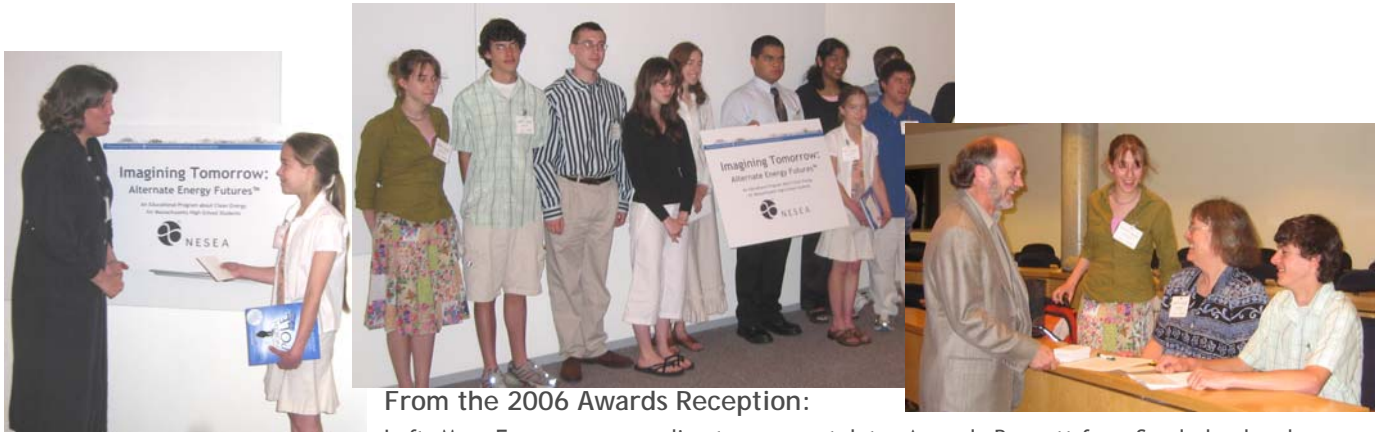
From the 2006 Awards Reception:

Imagining Tomorrow: Alternate Energy Futures™ , is an innovative and effective program about clean energy that is running for the second year in Massachusetts, in partnership with the Northeast Sustainable Energy Association, with major funding from the Massachusetts Technology Collaborative and additional funding from the Genzyme Corporation.